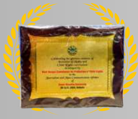
WB COMMISSION FOR PROTECTION OF CHILD RIGHTS