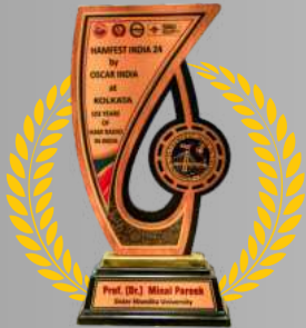
HAMFEST INDIA 2024